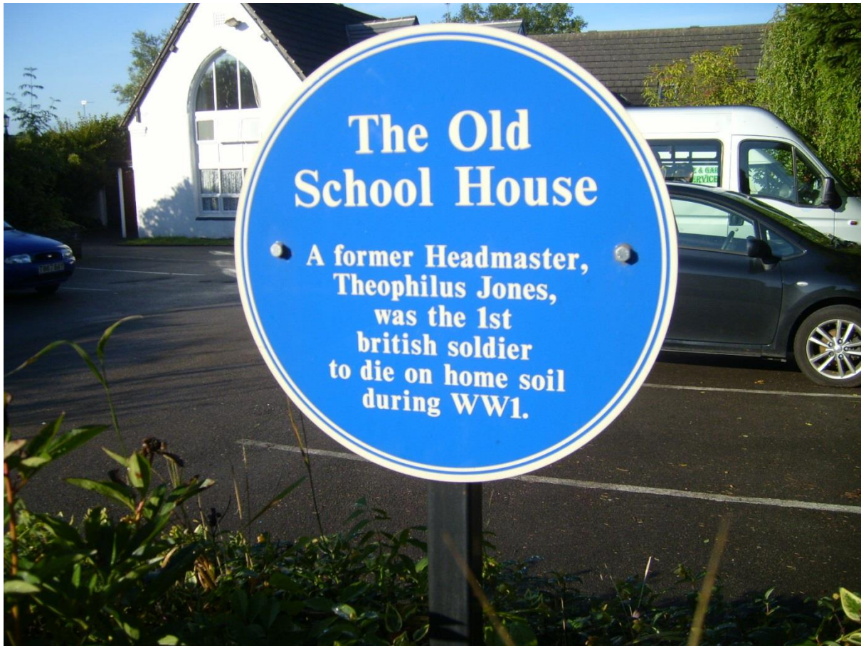
THEO JONES SIGN FOR SCHOOL HOUSE AT THRINGSTONE VILLAGE SCHOOL AND COMMUNITY CENTRE