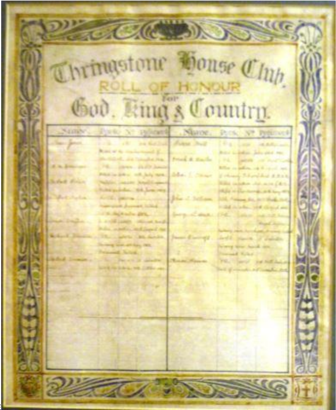
THRINGSTONE ROLL OF HONOUR