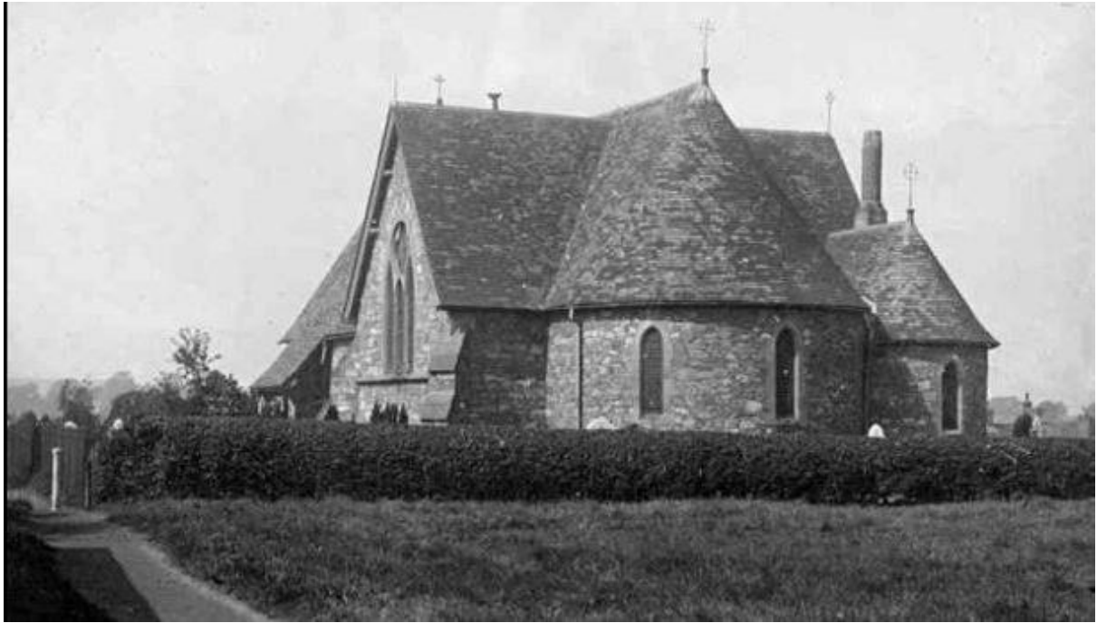
ST ANDREWS CHURCH.